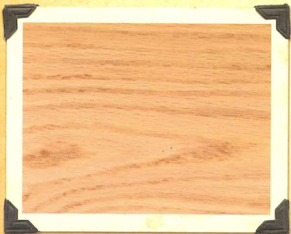
White Birch - S971