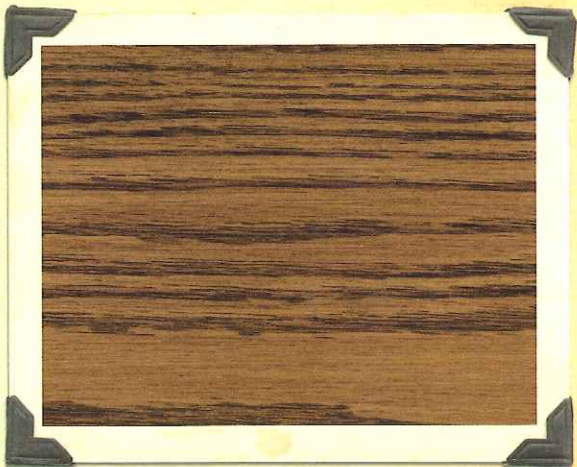
Dark Walnut – 4N5