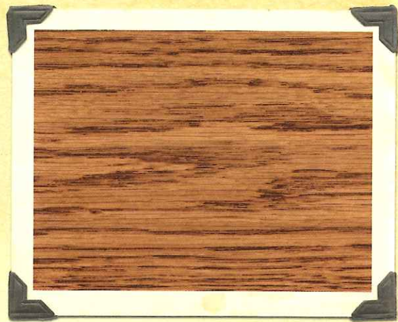
Fruitwood - 4N3