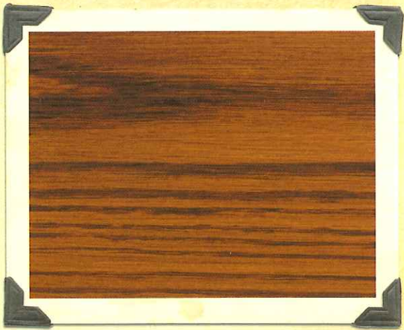
Burnt Sugar – 411