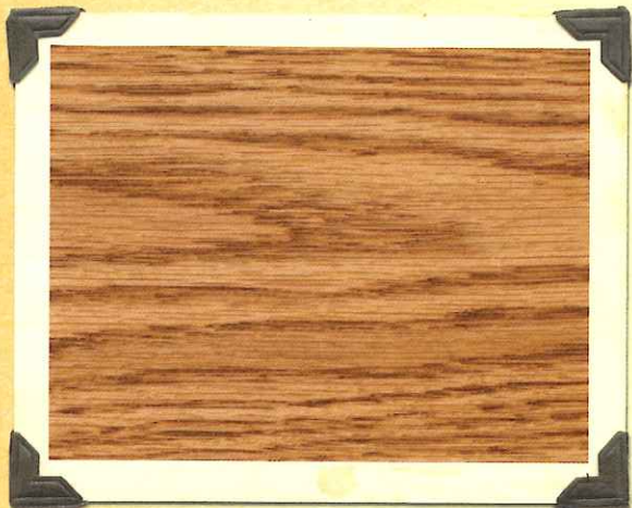
Cinnamon - 4N2