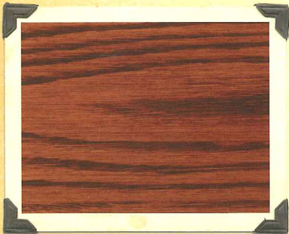
Vintage Cherry – 642