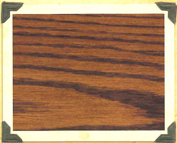
Mahogany – 4R7