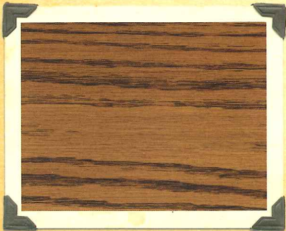
Danish Walnut – 347