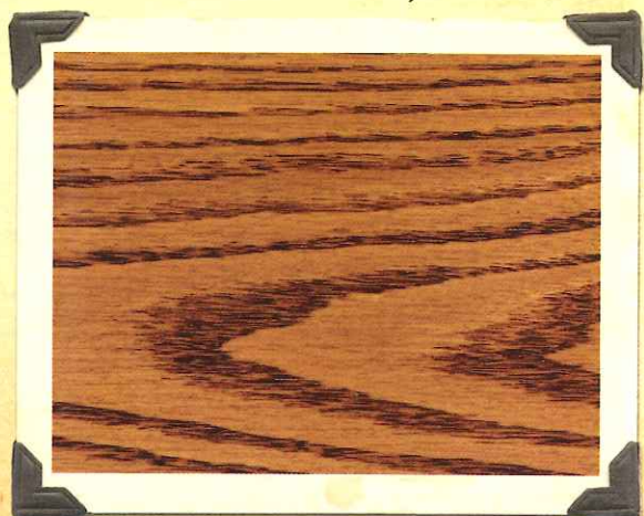
Golden Oak - 529