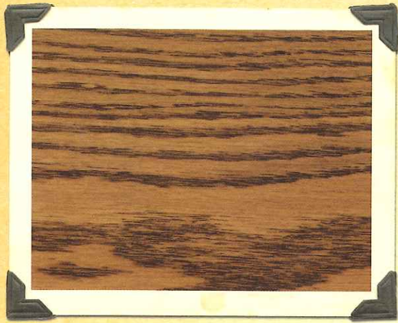
American Walnut - 47