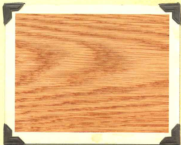
Early American Maple - S24