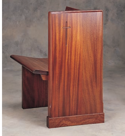
End 101, Body 64 SS shown in Mahogany