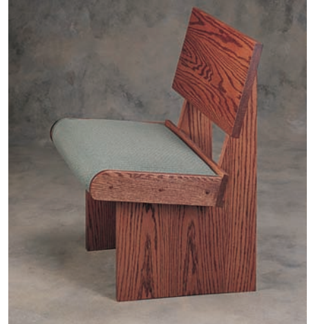
End 115, Body 90 US3