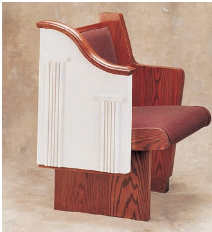
End 171, Body 70 US3