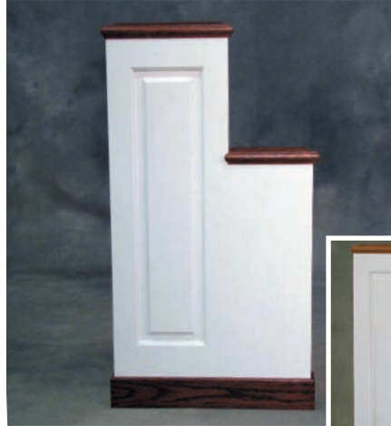
End 106, Body 74 US3 End 106 with optional custom two panel rout