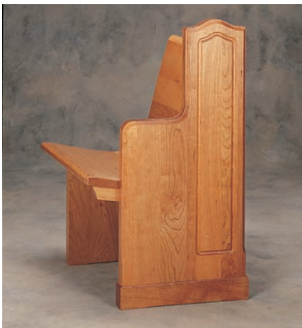
End 126, Body 64 SS shown in Cherry