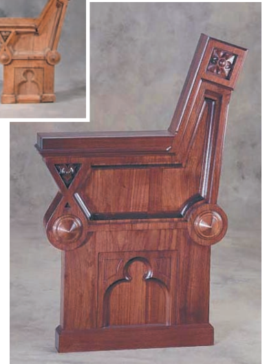
Custom End 12 After Replication

2 Ply Solid Oak Pew End Panels allow for custom routing.