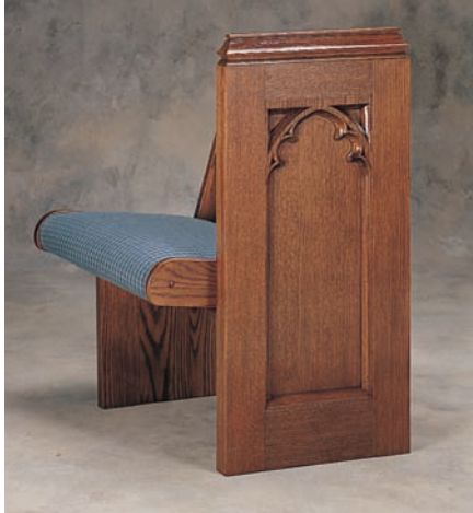
End 125, Body 50 US3