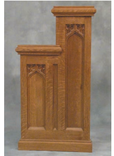
Custom End 11