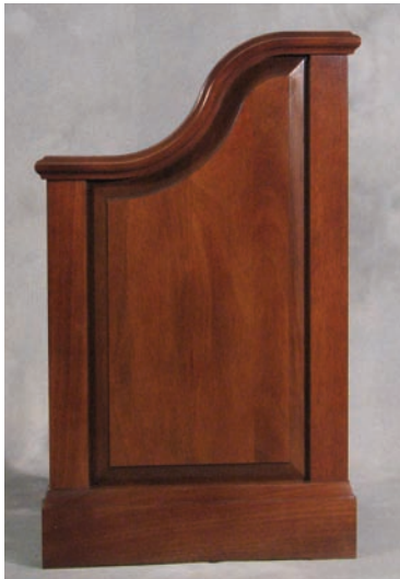
Custom End 2