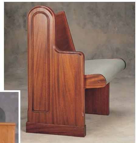
End 123, Body 54 US3 shown in Mahogany