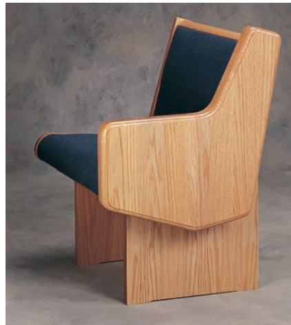
End 139, Body 74 US3