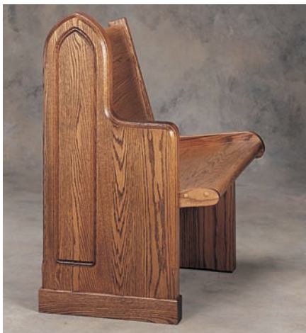
End 121, Body 54 LS