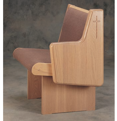
End 134, Body 84 US3