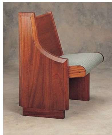
End 114, Body 54 US3 shown in Mahogany