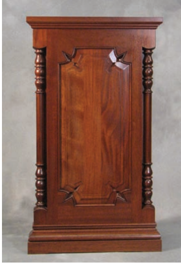
Custom End 1

If You Can Imagine It We Can Build It is what our customers have come to expect from New Holland.