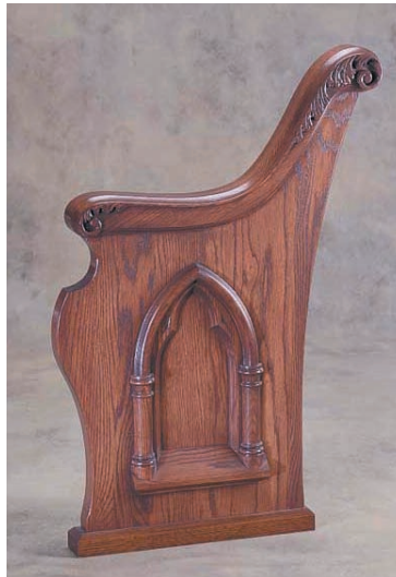
Custom End 5