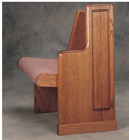
End 124, Body 54 US3