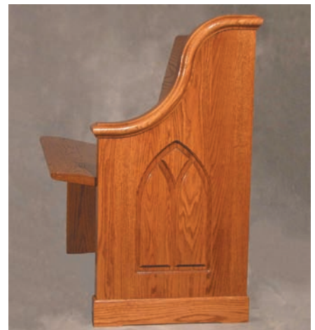
End 188, Body 64 SS