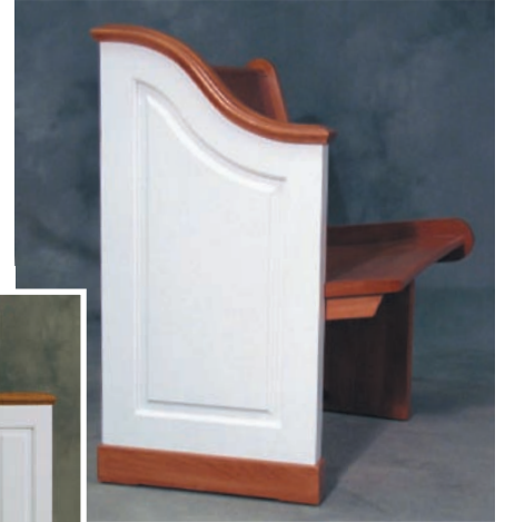
End 107, Body 50 SBB