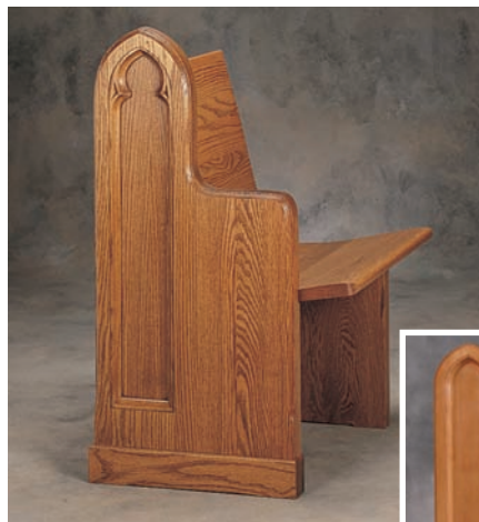
End 122, Body 64 SS End 122 with optional custom arm rest shown in European Beech