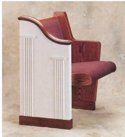
End 176, Body 80 US3