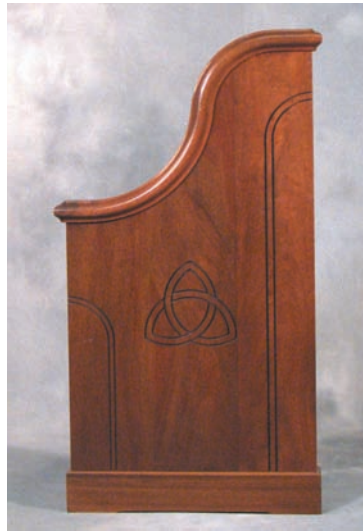
Custom End 4