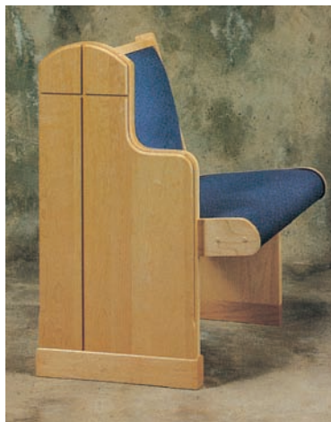
End 151, Body 74 US3 shown in Maple