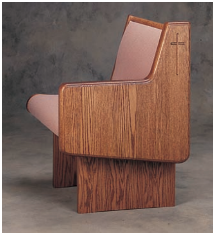
End 131, Body 74 US3