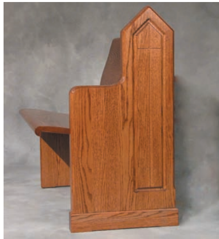
End 127, Body 65 SSC