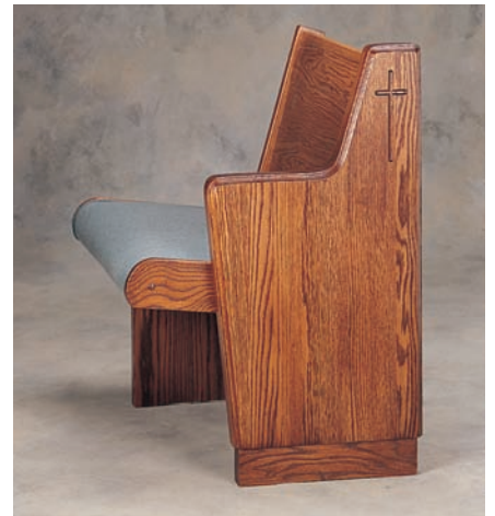
End 104, Body 54 US3