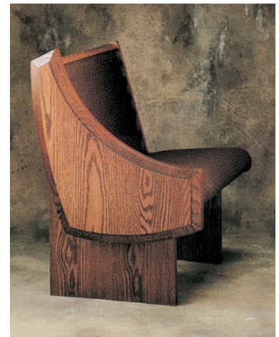
End 180, Body 70 US3 shown in Red Oak