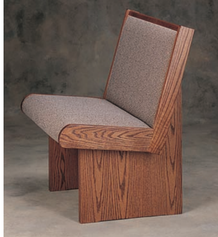
End 136, Body 70 US3 (end shown without edge cut)