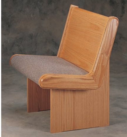
End 140, Body 54 US3