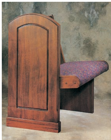
End 155, Body 50 US3 shown in Mahogany