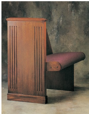
End 160, Body 50 US3 shown in Mahogany