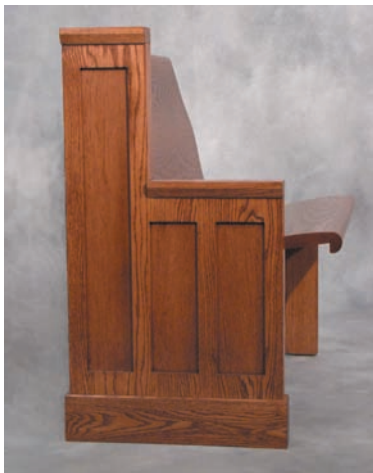
End 108, Body 65 SSC

All pew ends are shown in red oak or painted, unless otherwise noted.