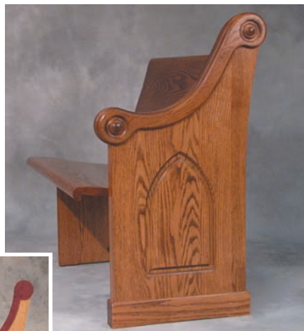
End 187, Body 65 SSC