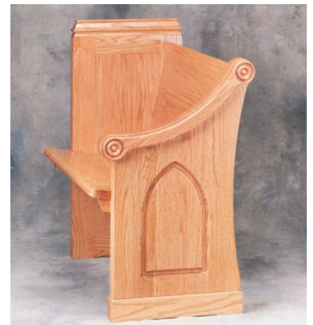
End 186, Body 64 SS