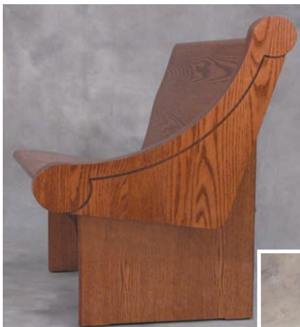
End 181, Body 65 SSC End 181 with optional two tone finish