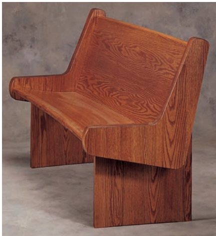
End 144, Body 50 SBB Radius