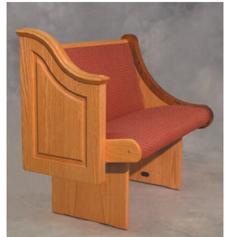
End 138, Body 70 US3