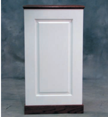
End 105, Body 50 US3