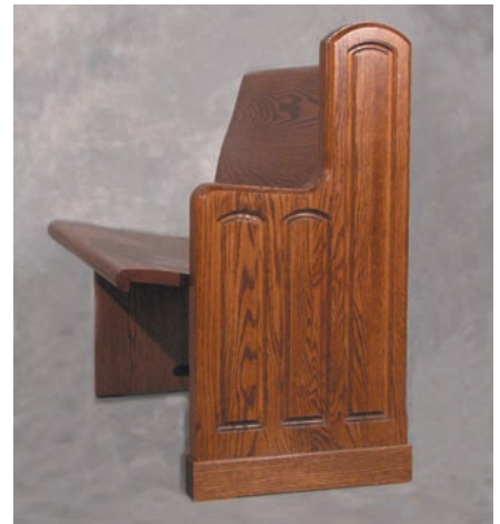
End 128, Body 65 SSC